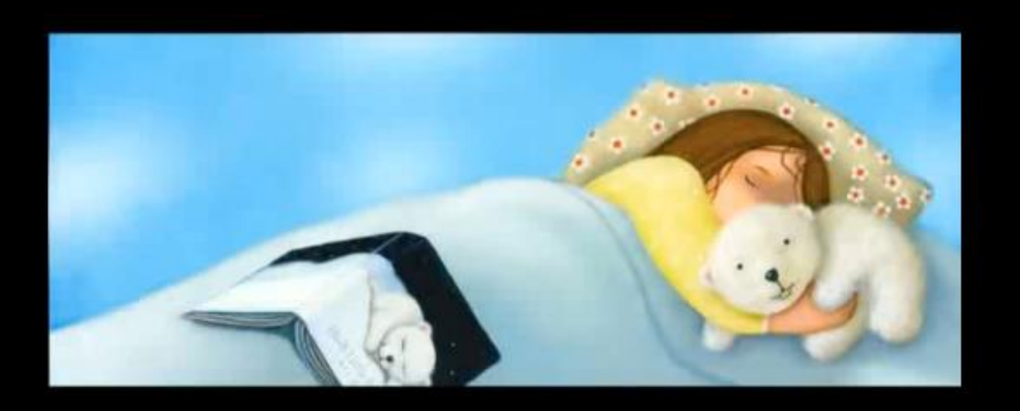
Then look right beside you and that's where I'll be.