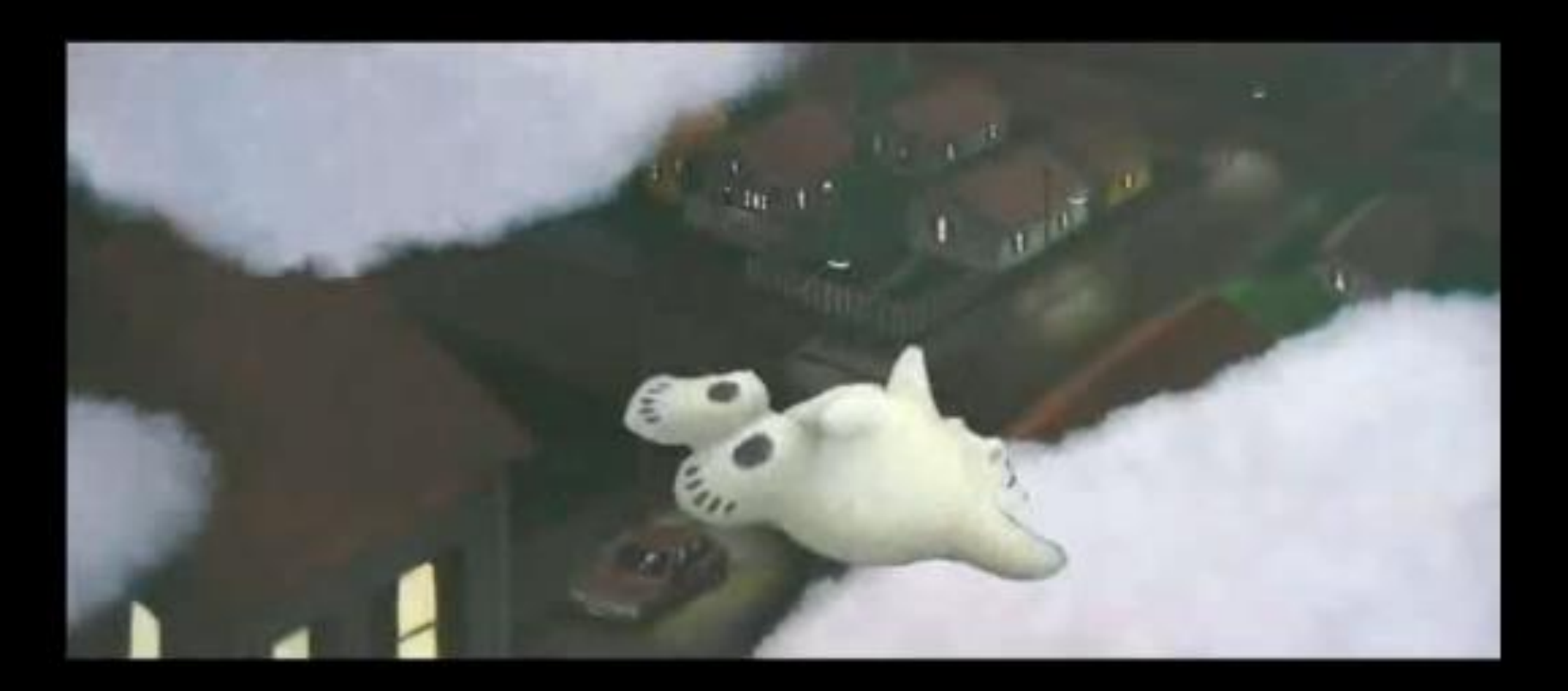
Dive through the clouds to a town far below