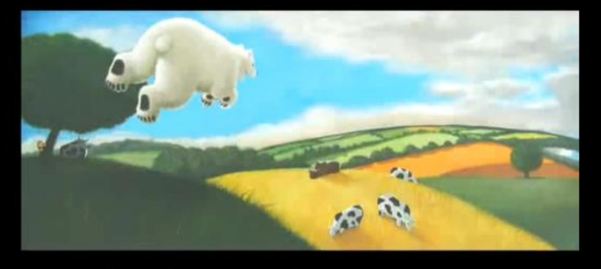
through a pasture where cows come to graze.