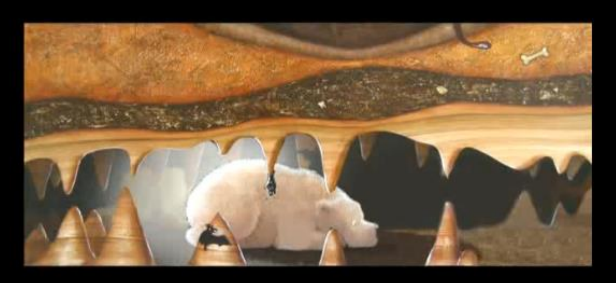
Creep through a cave with an underground maze.