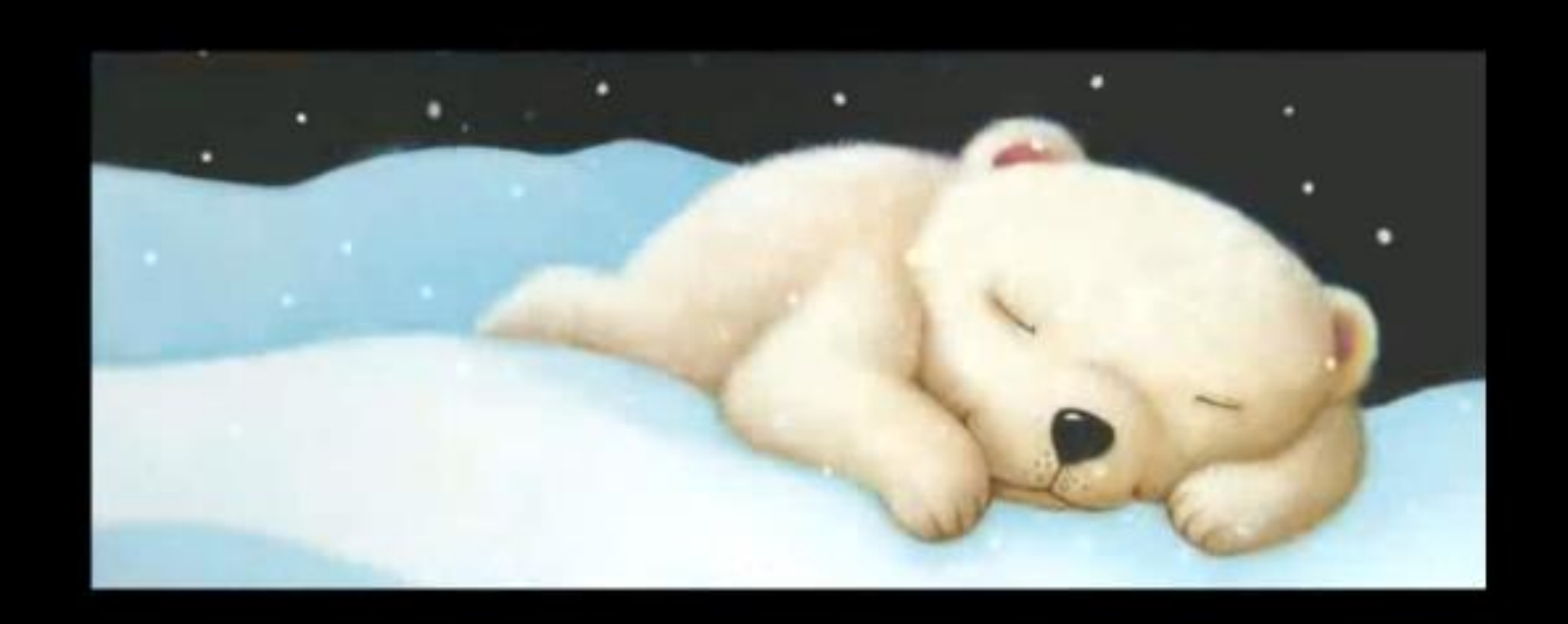
Hush little polar bear sleep in the snow