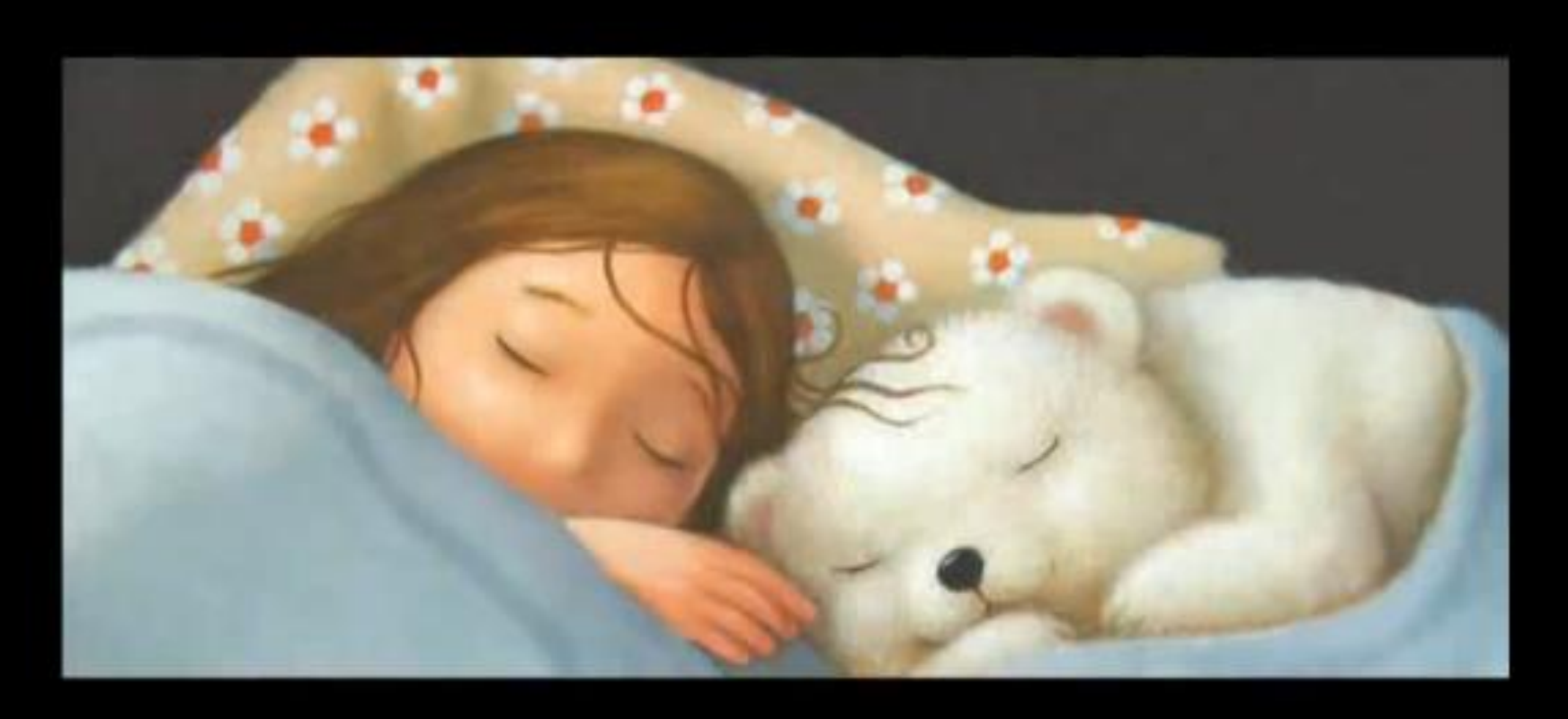
Curl up beside me and rest your sweet head.