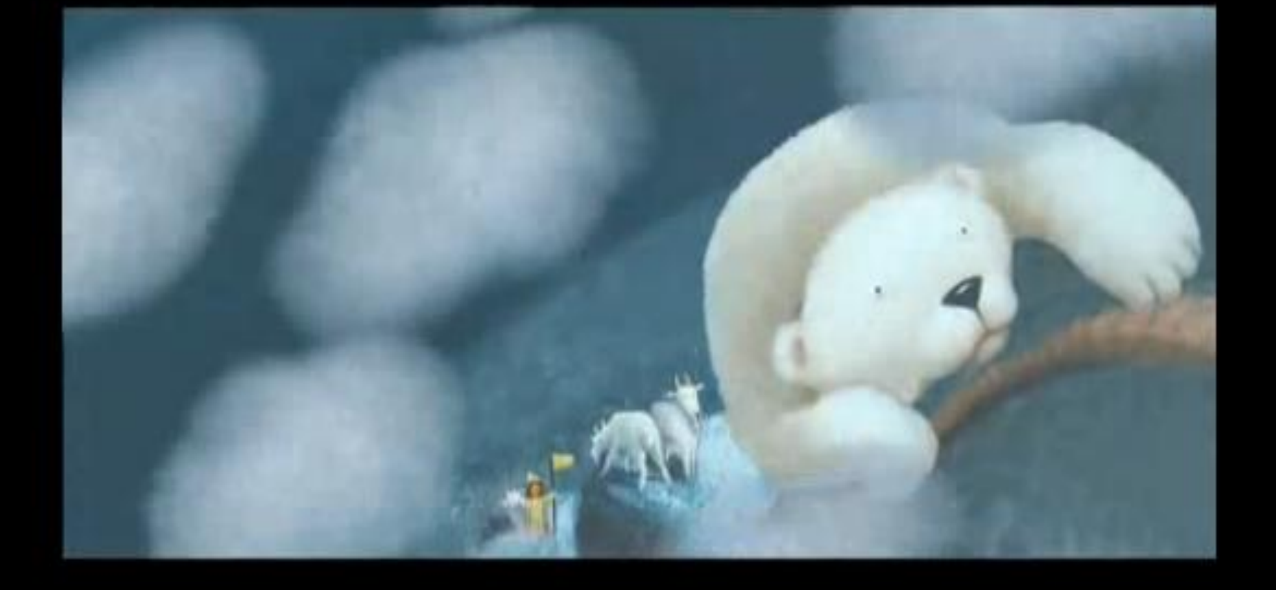
Climb a tall mountain where billy goats play