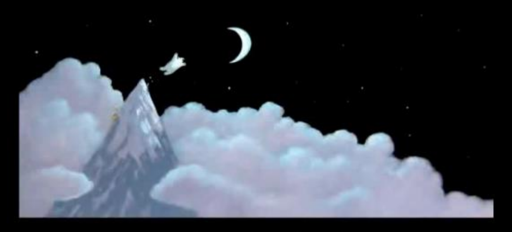
Leap from the peak and then float through the sky.