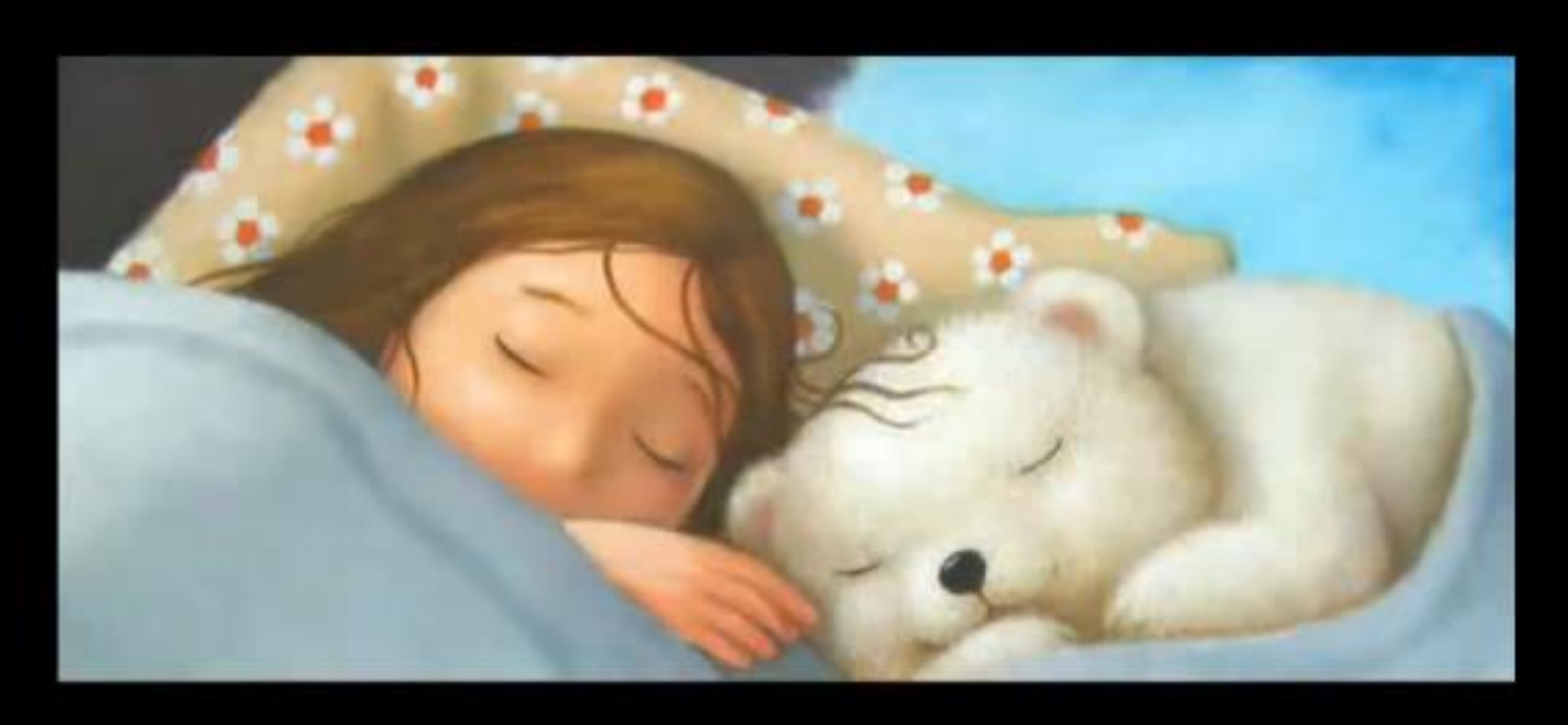
Pretend that you're sleeping and dreaming like me.