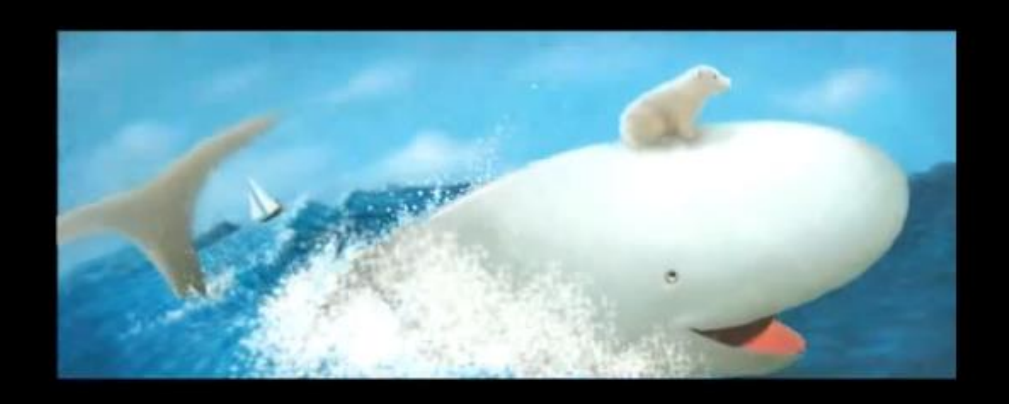
Sail the high seas on the back of a whale.