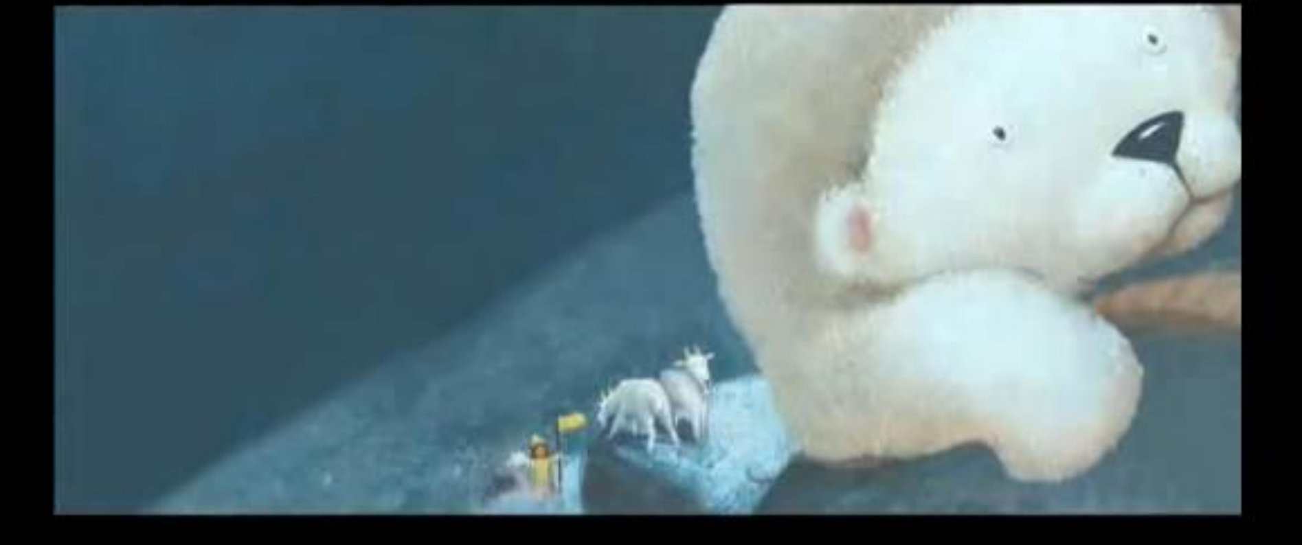
where breezes grow cooler and clouds fade away.