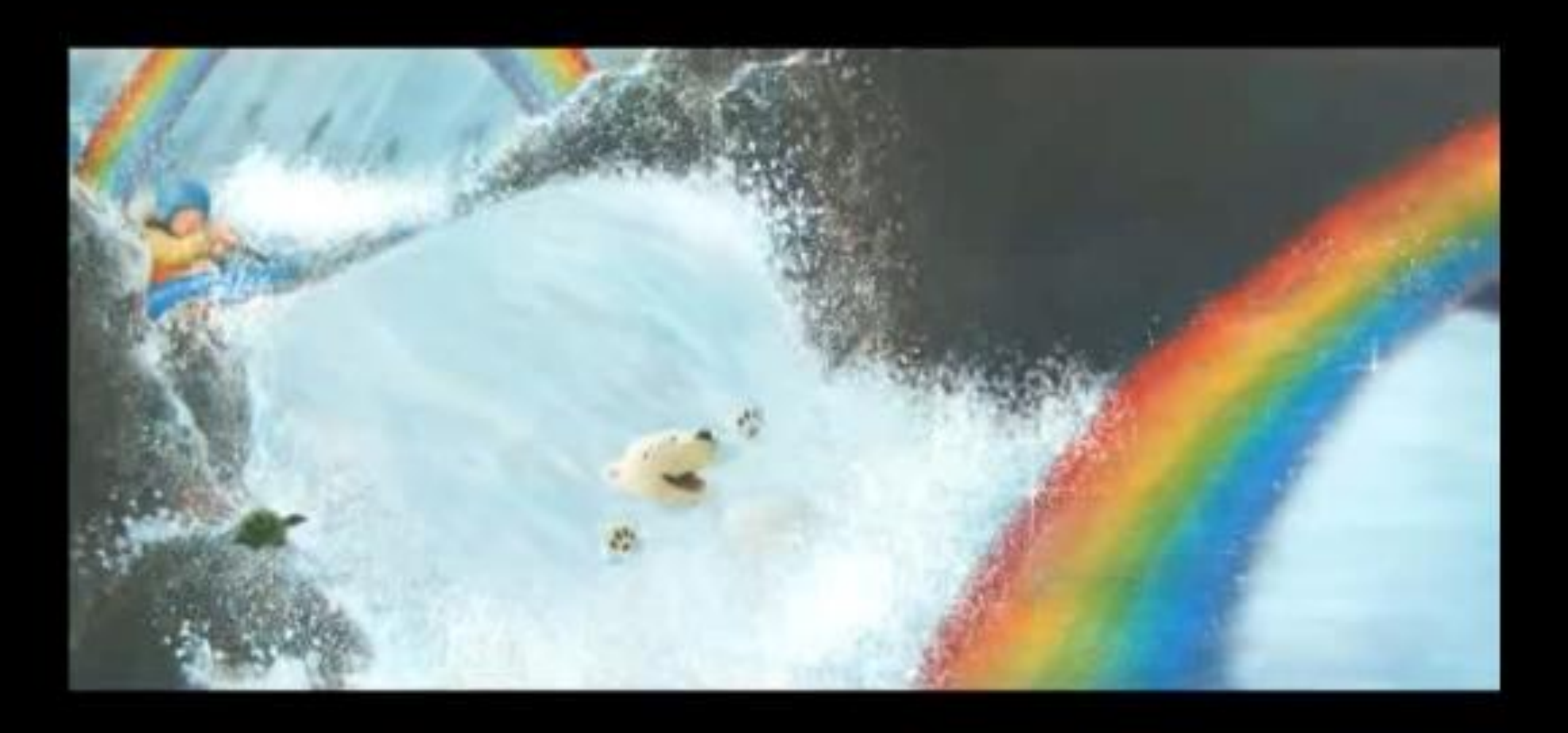
Paddle past rainbows that glisten and gleam.