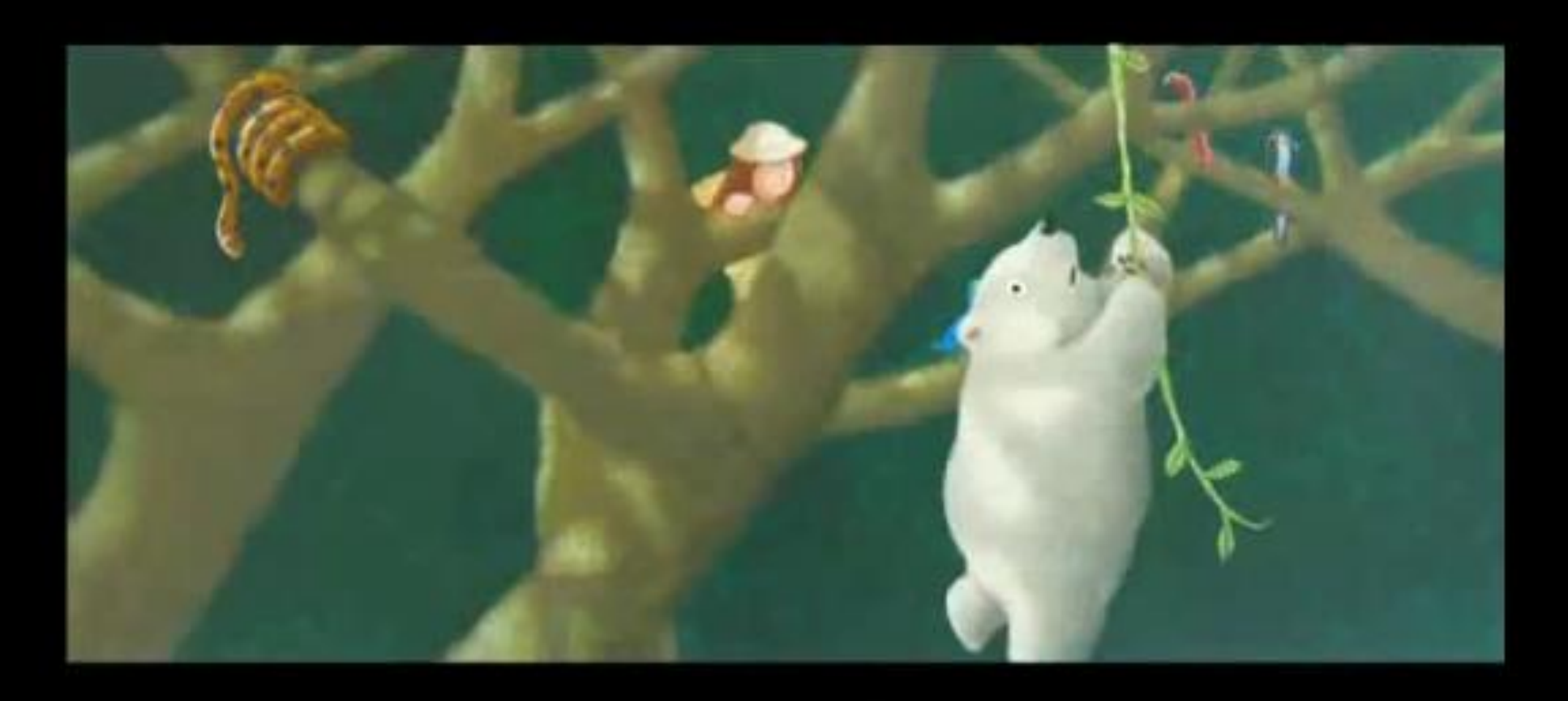
Swing through the trees from a dangling vine.