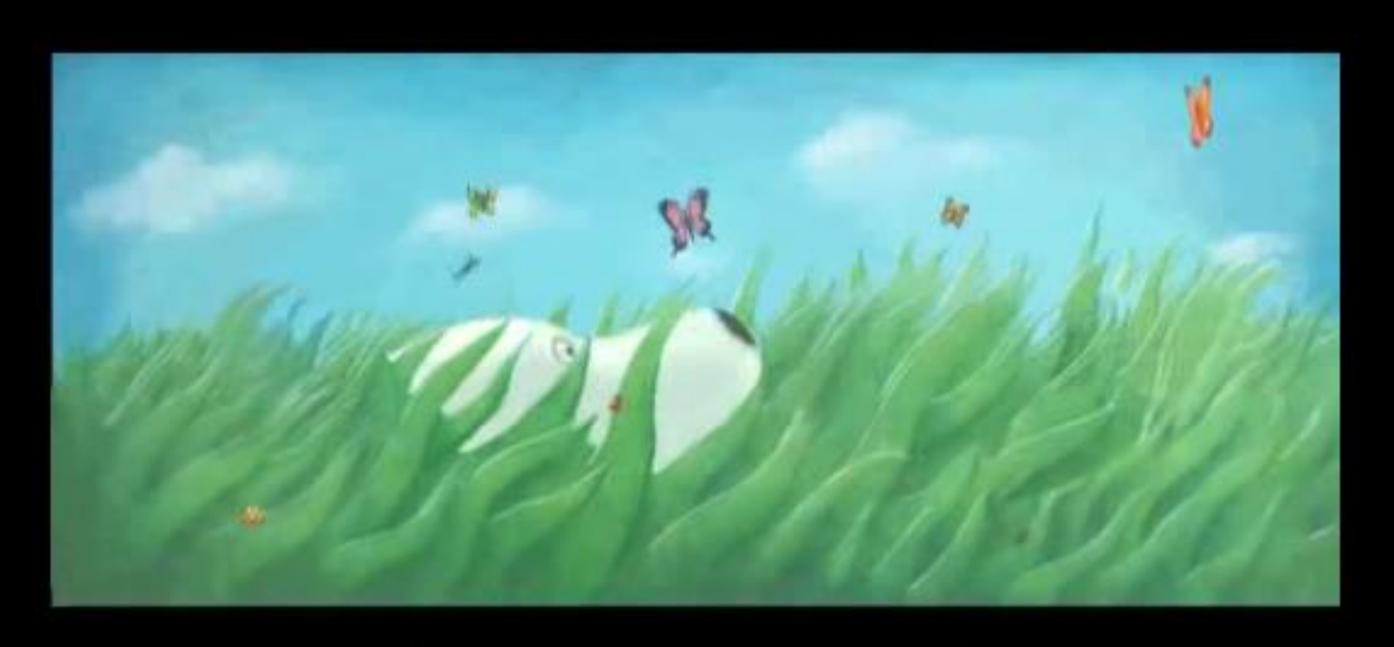
Wade through a marsh where the tall grasses grow