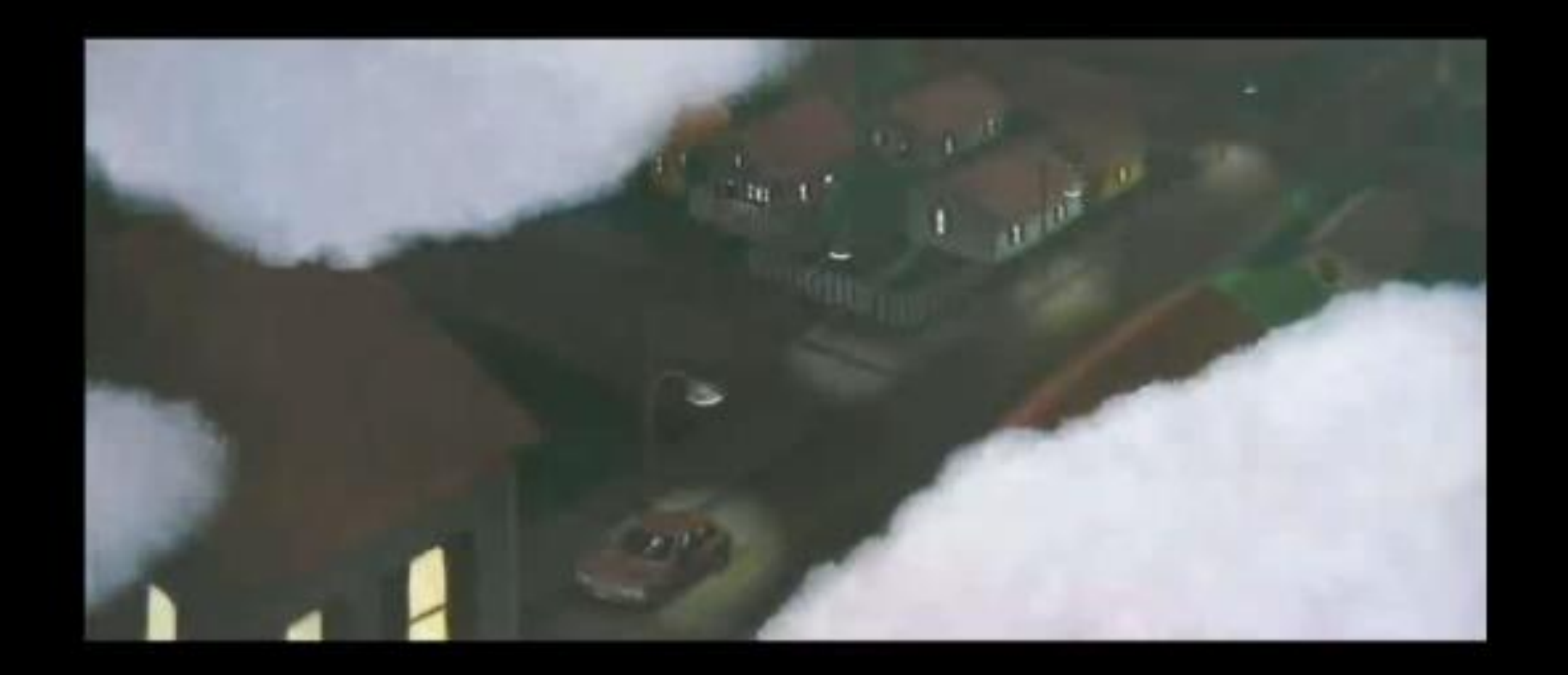
with the lights from the streetlamps and houses aglow.