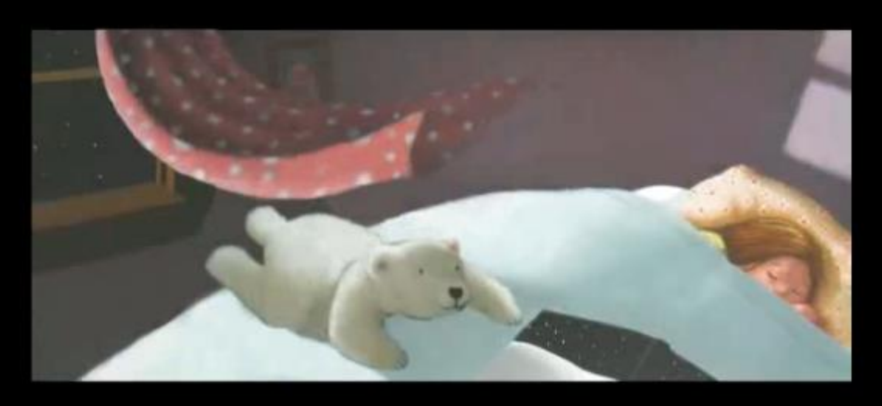
Drift through my window. Crawl into bed.