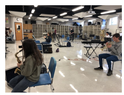
High School Band