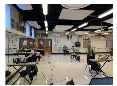
High School Chorus

The High School Orchestra students are learning many new technical skills, as they learn how to record themselves for a virtual video. This is a new and difficult challenge as students learn to play with a track instead of a conductor, and learn how to listen both to themselves and the track together. It has been a busy fall for us! The High School Orchestra will be playing "Counting Stars" by One Republic, for the virtual concert.