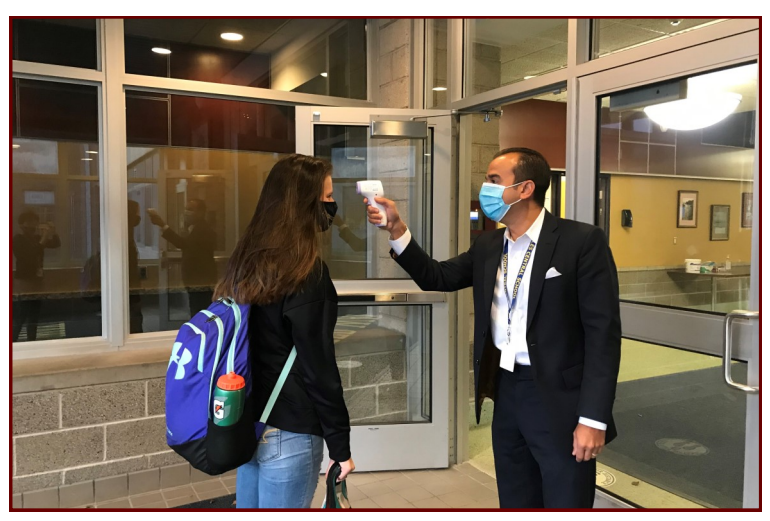
Opening day at Skaneateles High School

If someone was to ask me in August if we would still be in school in November, I would have said I hope so, but... I am so thankful that we are still able to have students attend school. Albeit a little different this year, we are doing our best to provide some sort of normalcy for our students. We are so proud of our students and how they have cooperated every step of the way with our temporary new normal. Our students have been so respectful, understanding, and have shown such great perseverance. I attribute our success with all our efforts from our community, faculty and staff, and students, as we have been following the recommended COVID-19 protocols and helping to keep our community safe and our schools open. While we have passed our 10 weeks mark, it is vital for us all to keep up the good work by continuing to wear masks, social distance, keep our hands sanitized, stay home when feeling ill and follow the screening and testing protocols. Please enjoy this Fall newsletter as we have worked to have as many events, clubs, activities, and athletics for our students to participate in along with all our courses and electives. Have a great Holiday Season everyone!