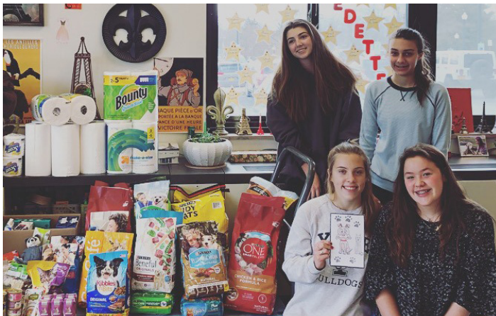
Freshman French students pose with their supply collection for the SPCA of Auburn

Students in the freshman French class recently put their minds to good use to help out our furry friends!