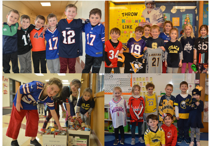
Waterman students pose for pictures in their Spirit Week gear!