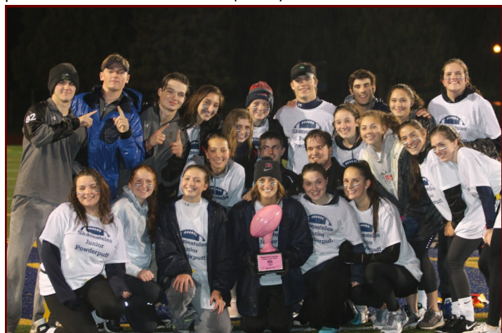
Students took part in the annual Powder Puff Game on November 1st (above)