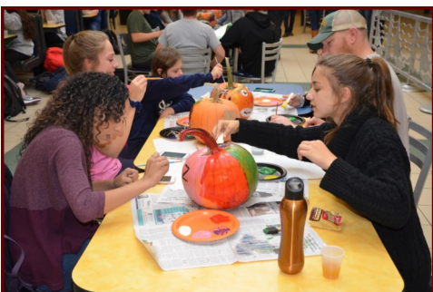
Senior mentors spent time painting pumpkins with their Freshman links (above)