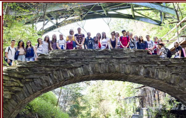
A stop at one of Ithaca's gorges during an Art Class field trip to the Johnson Museum at Cornell (above)